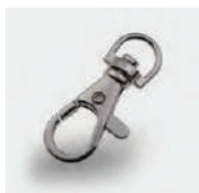
Silver Trigger Hook