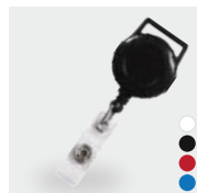
Round Shaped Reel Badge