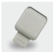
Retractable Reel Badge