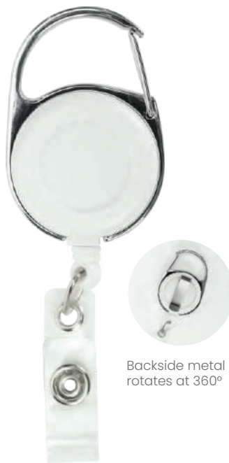
Backside metal clip rotates at 360°