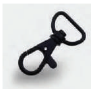
Black Trigger Hook