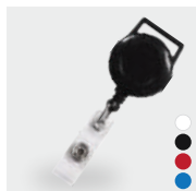
Round Shaped Reel Badge