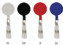
W BK R BL