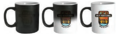
Original Color ▶ Pour in Hot Beverages Changing Stage ▶ Design Revealed